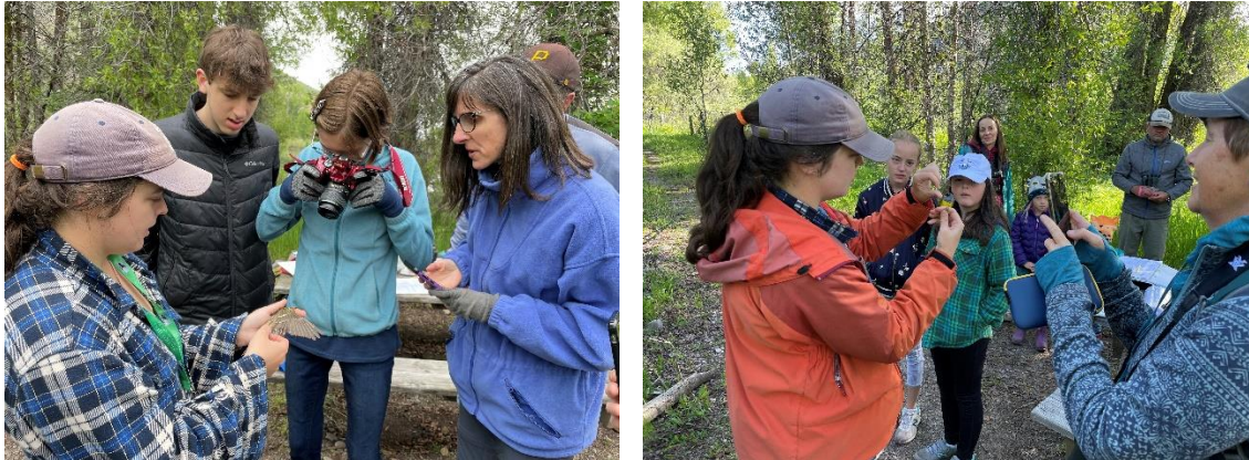
Figure 5. During the 2023 season, the MAPS banding stations had record visitation, including tourists engaged through Being Wild and many local families.

We were assisted by 18 volunteers and interns throughout the season. Additionally, we engaged 109 visitors at the banding station in education/outreach this summer. Of these, 10 were reached through the JHWF's Being Wild campaign, a voluntourism outreach effort. Fifteen children visited the banding station this year, ranging from 2 to 18 years old. We are happy that visitation has grown at the banding station and we hope to continue expanding outreach and education efforts because a visit to a banding station can be a very influential experience in someone's life, especially for children (Figure 5).