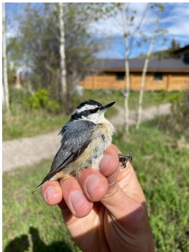
Figure 2. A first cycle formative Red-breasted Nuthatch was captured at our TSS- MAPS banding station in 2023.

Interesting captures from 2023 include Vesper Sparrow, Hermit Thrush, and Red-breasted Nuthatch (Figure 2). A full list of species including newly banded birds, recaptures, and unbanded birds can be found in Table 2.