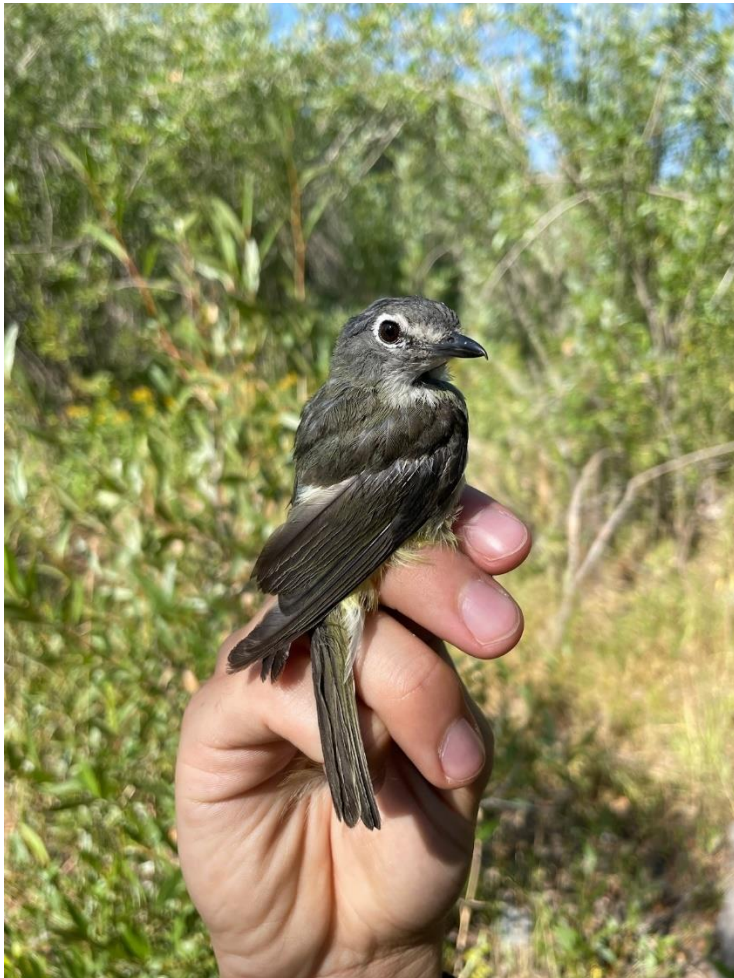
Figure 4. This Cassin's Vireo was banded in 2022 and another individual with similar characteristics was banded in 2023. We did not take a photo of the 2023 bird, as it was in very heavy molt, and we prioritized processing it quickly over getting photos.

Until 1997, members of solitary vireo complex were considered to be one species (Goguen and Curson 2020). The status and distribution of the two most expected vireos from the complex (Cassin's and Plumbeous Vireo) are poorly understood in northwestern Wyoming (S. Patla, pers comm.). The Cassin's Vireo we captured this year was a female in heavy molt which had evidence of a brood patch. Definitive basic plumage in this species is acquired on the breeding grounds after nesting, indicating that she had likely bred somewhere within the Greater Yellowstone Ecosystem, not too far from where she was captured (Goguen and Curson 2020). A Cassin's Vireo banded at JACK in 2022 was the first record of that species at the station and was in similar condition to the 2023 bird, with heavy molt and a molting brood patch (Figure 4). Understanding the status and distribution of cryptic species such as those in the solitary vireo complex is one benefit of long-term banding station operation.